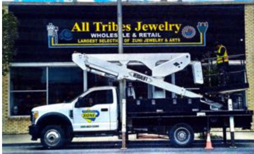
All Tribes Native American Arts & Jewelry